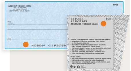
Photo Safe Deposit® icon indicates the check includes mobile deposit fraud prevention features.

ImageMatch® confirms unique check data matches the front and back of the check to help prevent fraud.